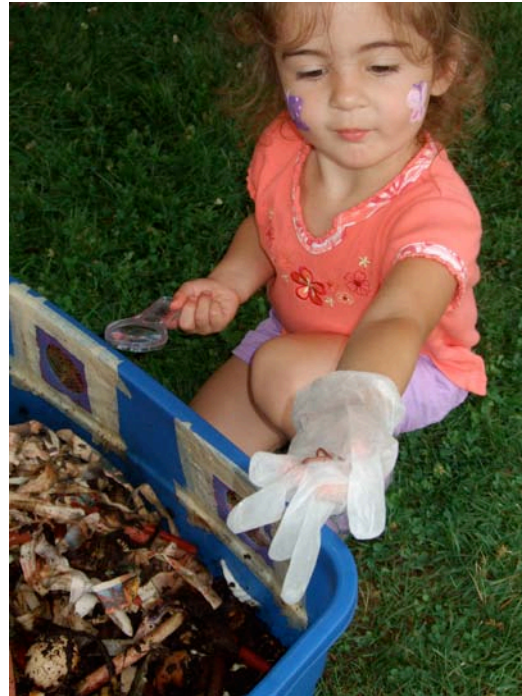
Exploring Composting Worms

Most educational activities were focused on children and held in the "Kids Tent." These included the building of rainsticks, fish prints of a real flounder, seed planting in recycled news paper pots, fishing for laminated native warm and cold water fish, and examining composting red worms. There were two guided walks, one directed toward children and focused on native and invasive plants along the river, and the other directed toward adults and relating to the theme of natural history along the river. There was an ongoing demonstration of how to fly-fish. The Youth Conservation Corps demonstrated a riparian buffer planting on the riverbank.